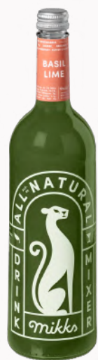
Mikks Basil lime 75cl Bottle