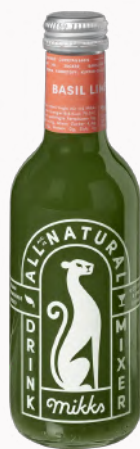
Mikks Basil lime 25cl Bottle