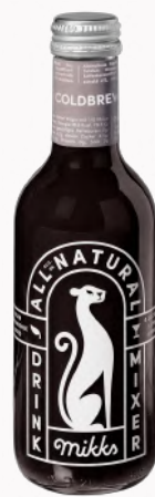
Mikks Coldbrew Cacao 25cl Bottle