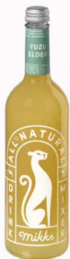
Mikks Yuzu Elder 75cl Bottle