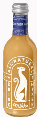
Mikks Ginger Mint 25cl Bottle