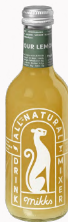
Mikks Sour Lemon 25cl Bottle