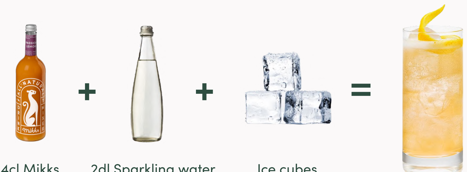
4cl Mikks 2dl Sparkling water Ice cubes