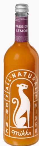
Mikks Passion Lime 75cl Bottle