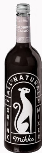
Mikks Coldbrew Cacao 75cl Bottle