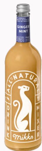
Mikks Ginger Mint 75cl Bottle