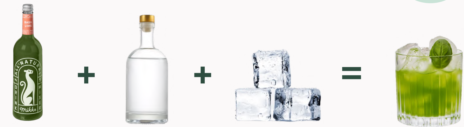
4cl Mikks 4cl Non-alc spirit Ice cubes