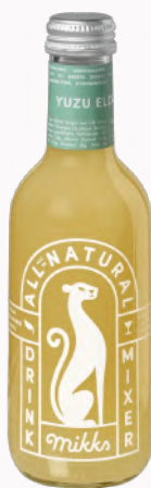
Mikks Yuzu Elder 25cl Bottle