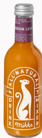
Mikks Passion Lime 25cl Bottle