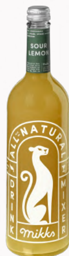
Mikks Sour Lemon 75cl Bottle