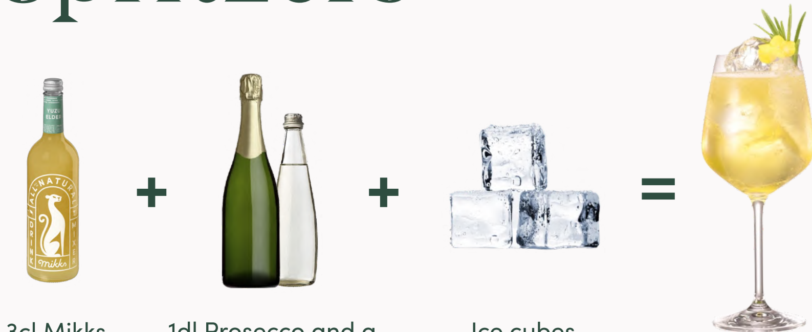
3cl Mikks 1dl Prosecco and a splash sparkling water Ice cubes